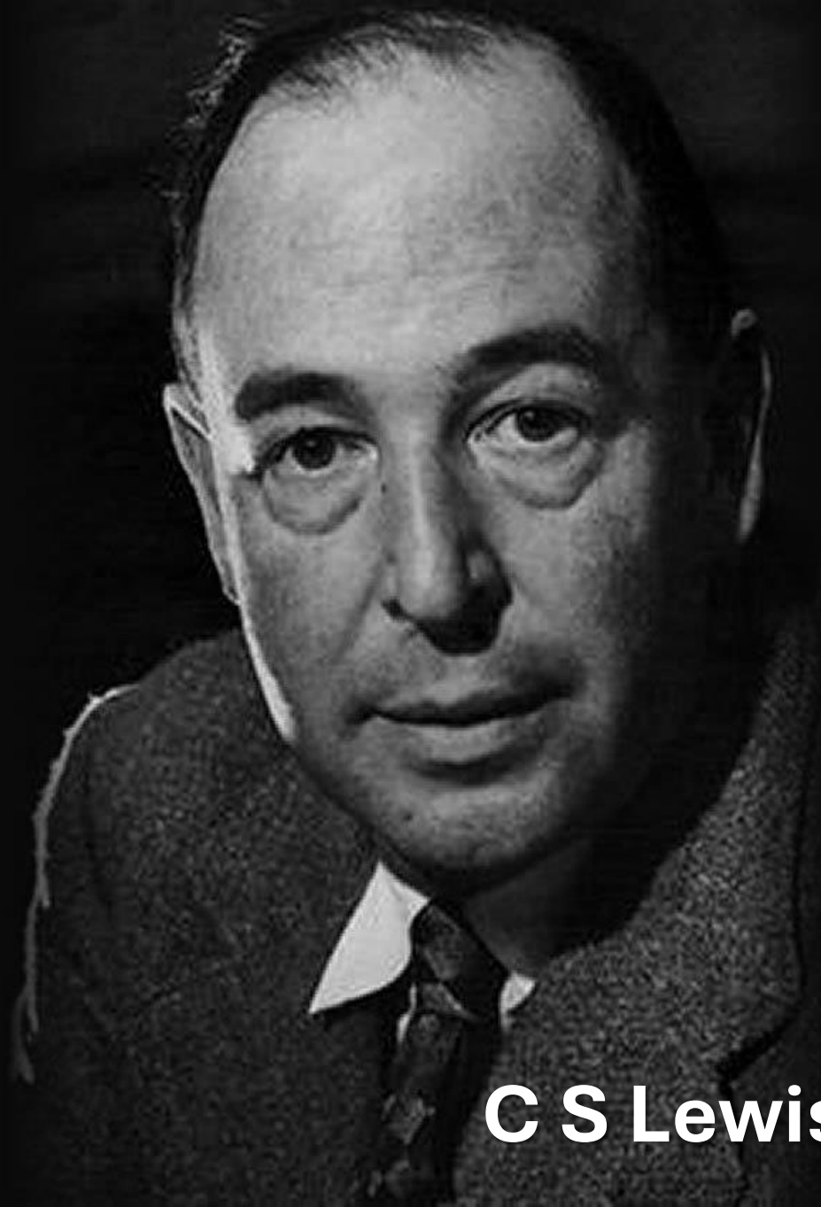
C S Lewis: Surprised By Joy